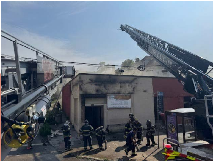
1121 Roof Operations Commercial Building fire with East Cleveland FD