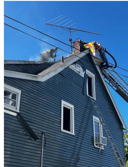
1121 Roof Operations Residential Building fire with Cleveland Heights FD