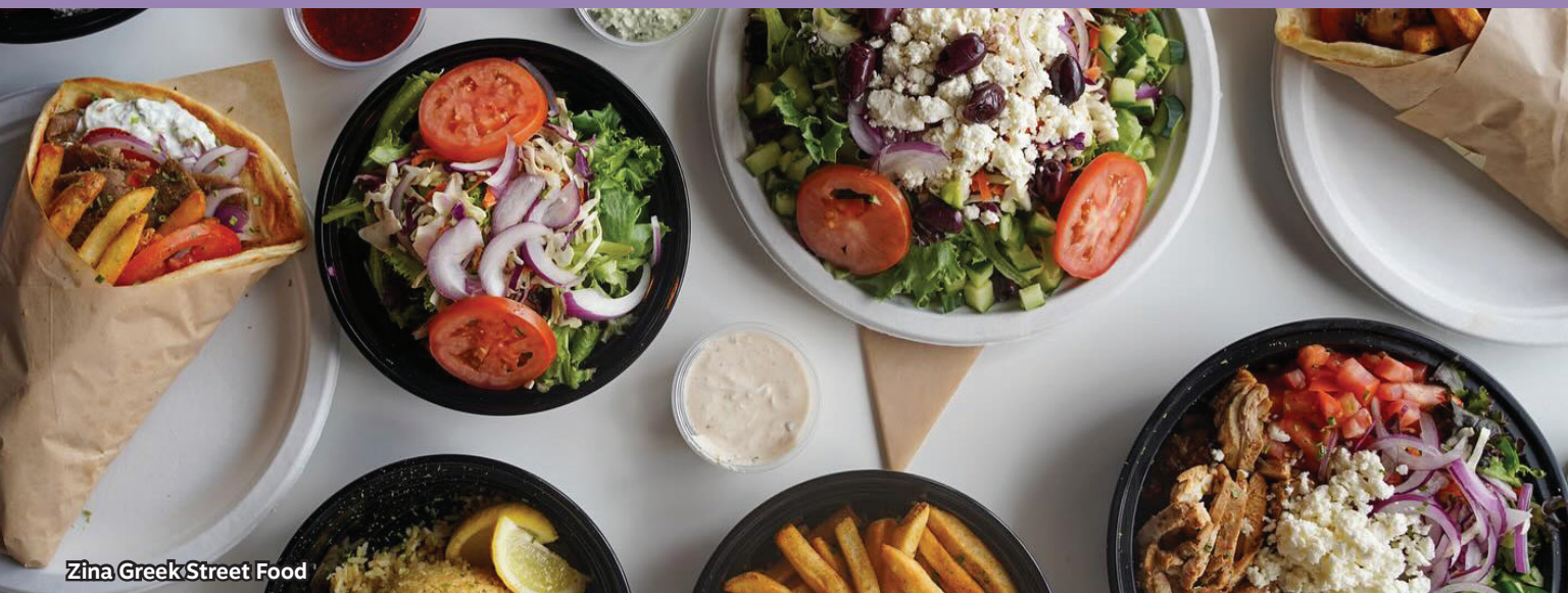
Zina Greek Street Food