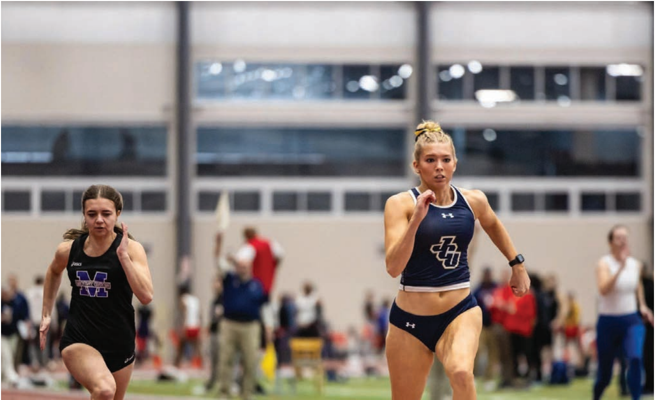
Starting in the 2025-26 school year, JCU will compete in the North Coast Athletic Conference.

L ate last month, John Carroll University announced the institution will join the North Coast Athletic Conference (NCAC) beginning in Fall 2025. The athletic conference change is the latest step in John Carroll's three-year, $100 million strategy to bolster the student experience, grow the academic portfolio, enhance the campus, and expand the institution's reach.