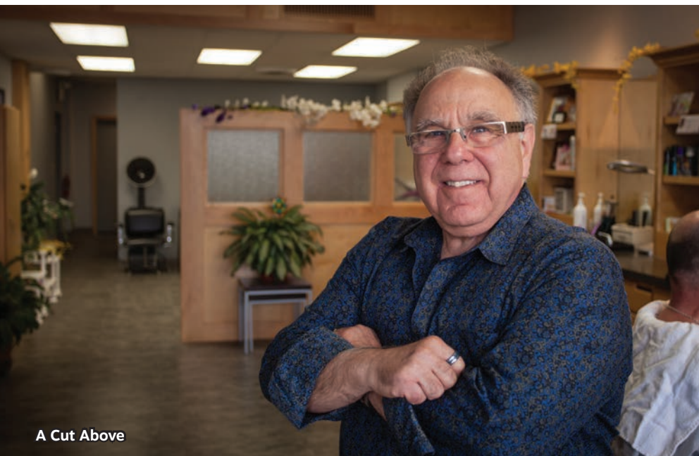
A Cut Above