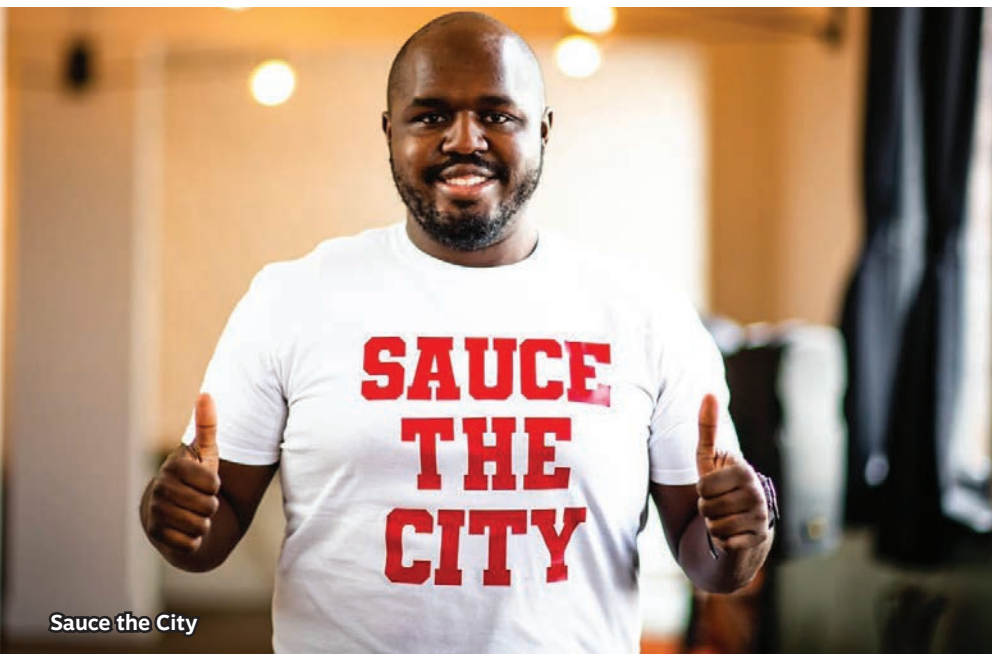
Sauce the City

20670 John Carroll Boulevard (216) 371-3242 parkopticianscleveland.com