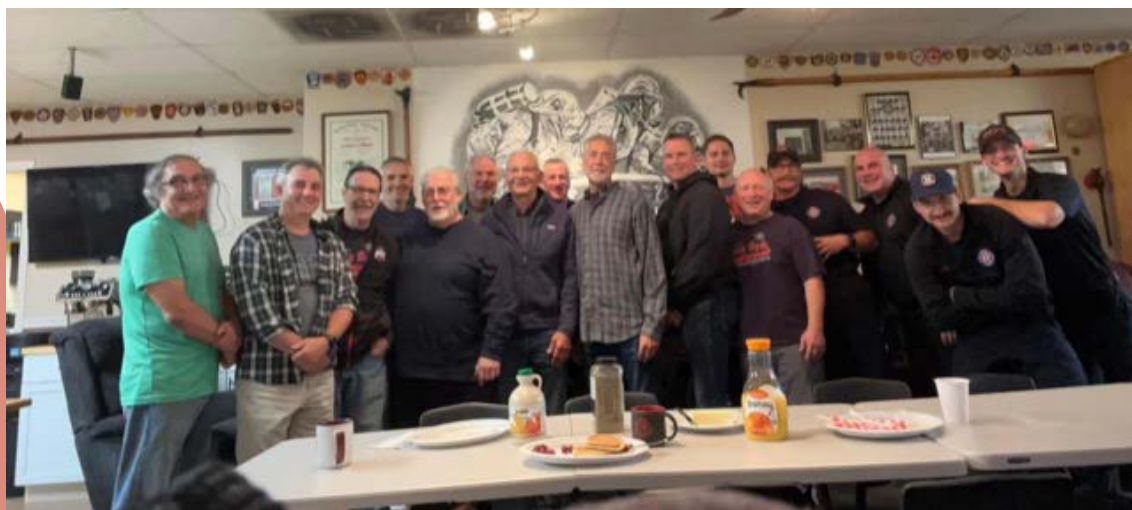
Photograph taken at the breakfast for active and retired Local 974 members. It can be located on the UH Firefighter local Facebook page.