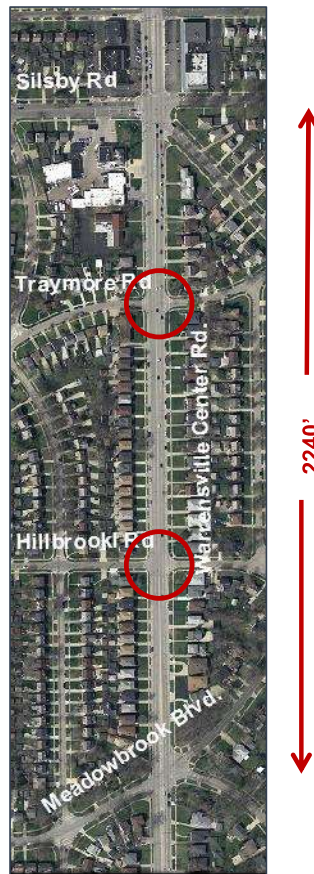
Figure 13: Warrensville Center Road