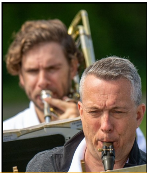
At John Carroll