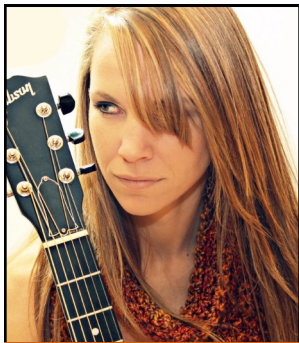
At Walter Stinson Community Park